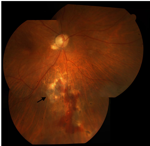
Fig. 2 LAMPatch (Black arrow) adhered to the retinal surface covering the retinal break