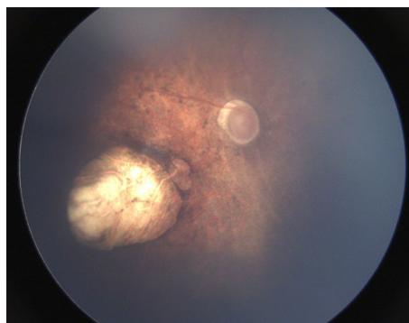
Fig. 2 Wide-angle fundus image (Retcam®) of the right eye of an infant with presumed Zika virus congenital infection showing sharply demarcated chorioretinal scarring with gross pigment mottling on the macula

The persistence of CHIKV and/or CHIKV-encoded components in deep sanctuaries could play a role in